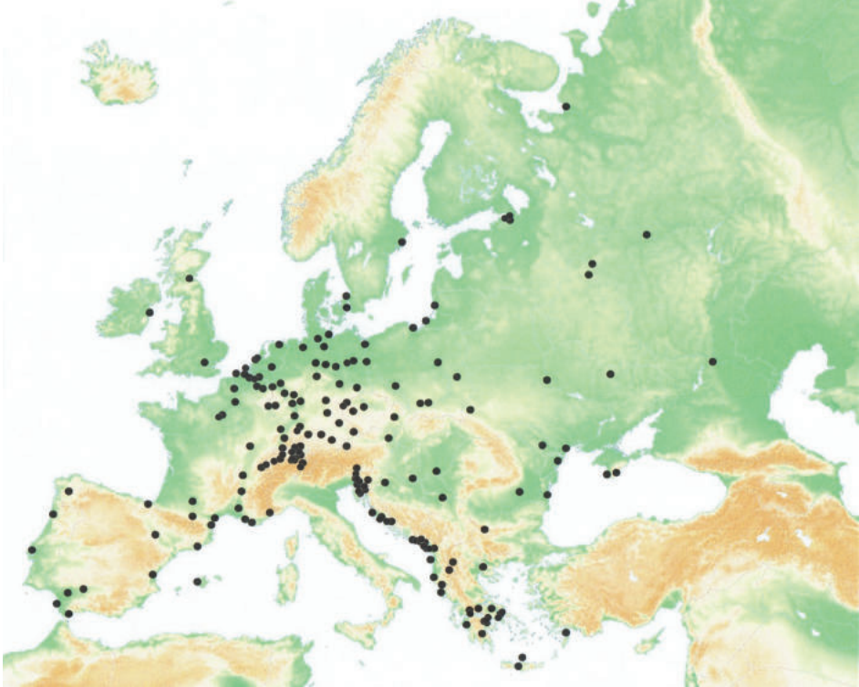
Figure 3. Italian exonyms for populated places in Europe (Author's draft according to Toniolo 2002)

Regarding the spatial spread of Italian exonyms, two aspects are most characteristic: their crowding along the eastern coast of the Adriatic as well as in the Ionian and Aegean space; and their high density in German-speaking and adjacent areas (especially Belgium, but also the Netherlands and Bohemia [Čechy]).