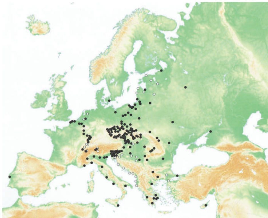
Figure 1. (Austrian-)German exonyms for populated places in Europe (Author's draft according to AKO 2012)

The spatial spread of (Austrian-)German exonyms primarily reflects the former German settlement or political domination, especially of the former Habsburg lands with a larger share of German-speakers up to World War II – what is today Czechia, Slovakia, Polish Silesia [Śląsk] and Slovenia – secondly also outside the former Habsburg lands, e.g. in present-day Poland or Russia's Kaliningrad region, the northern part of formerly German-settled Prussia. This corresponds to historical relations still highlighted in the teaching of history, but also to later political and economic relations that continued even in times of the Iron Curtain and had a revival after its fall. It cannot be denied that using these exonyms has also a touch of nostalgia, of commemorating »a glorious common past«, but – except for tiny groups – nothing of political claims. The fading away of exonyms for places along the eastern Adriatic coast is mainly due to their Italian origin and the exodus of Italians at the end of World War II depriving the names of their former legitimation of being the names of the locally dominant language. The decline in use also of exonyms for the Croatian interior can simply be explained by the disappearance of the German