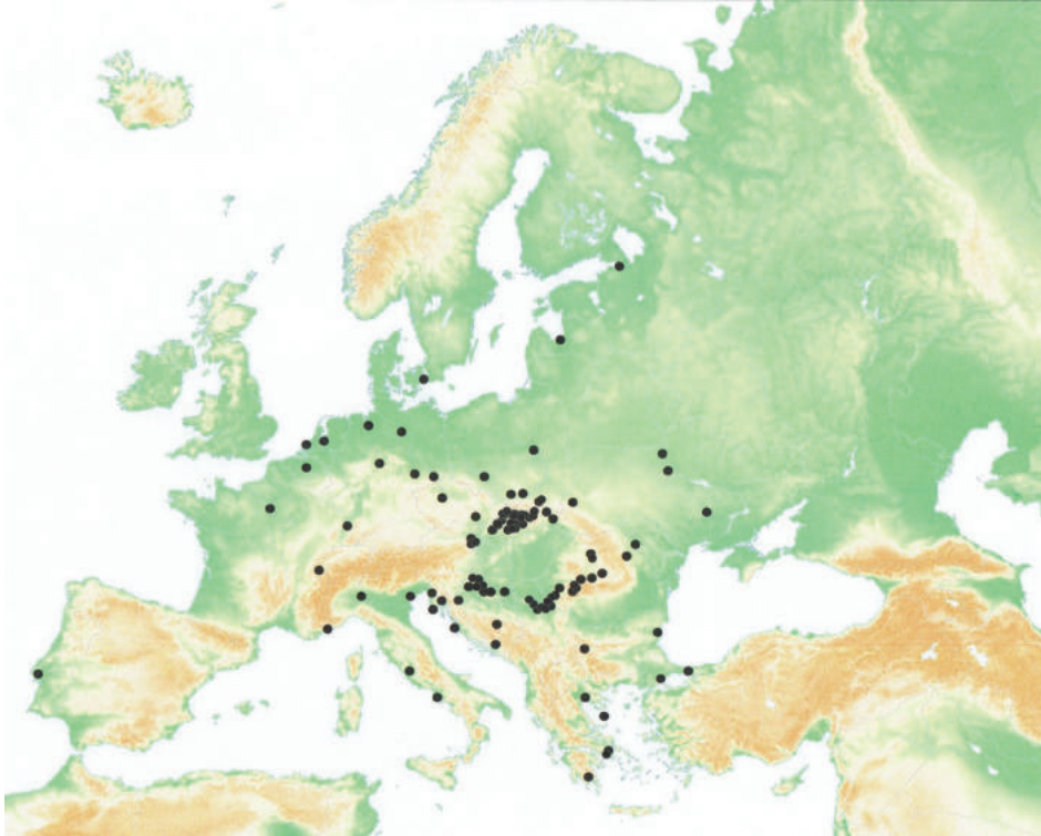
Figure 2. Hungarian exonyms for populated places in Europe (Author's draft according to Dutkó 2007)

only partly covered by black dots, if at all. The use of exonyms for places of the former Hungarian Kingdom is based on close relations up to the present day, but also expresses a kind of nostalgia, even more than in the Austrian case. Hungarian exonyms for these places appear even on road signs along motorways, in the first position.